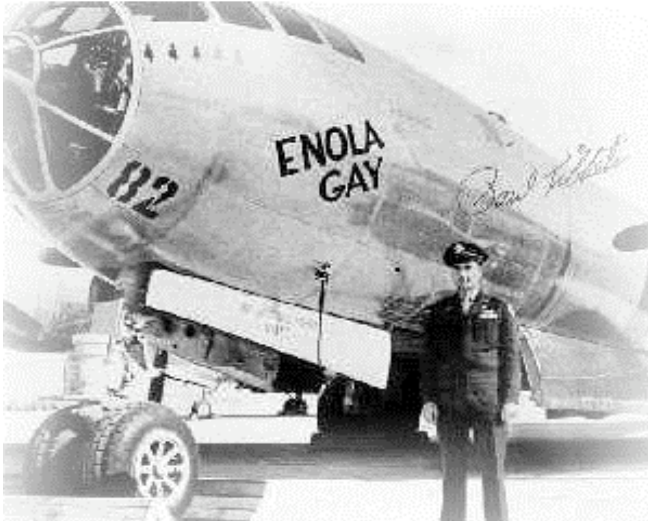
General Paul Tibbets and the Enola Gay